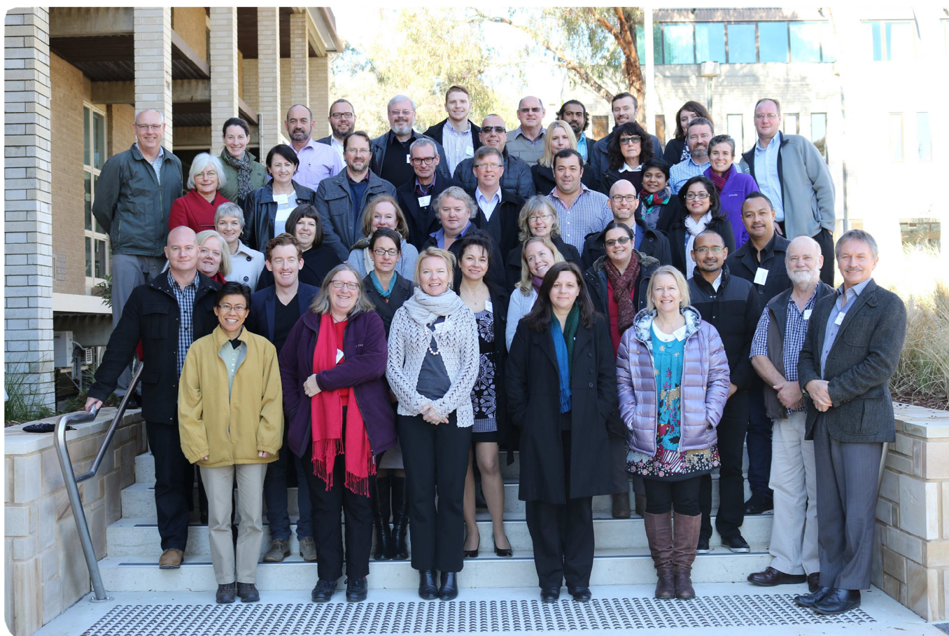
Benchmark 2 Summit Group participants

You will be able to determine if your VLE is still meeting the needs of your stakeholders or is it time to re-evaluate?